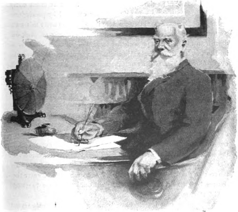
The Electrical Fan.

The electric motor is destined to enter largely into the operation of