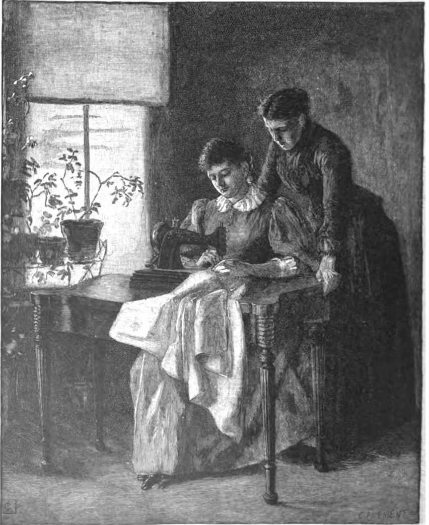
Sewing-machine Run by Electricity; the entire motor concealed in the wheel-case at the left.

As another example of use and ornament united, circular fans driven by motors are not uncommon, and are luxuries in hot weather,