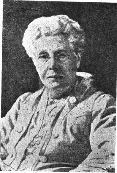
FIG. 212 President : DR ANNIE BESANT